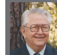
AEF EDWIN & AGNES JENNINGS TEACHING EXCELLENCE AWARD ENDOWMENT: $329,315.28