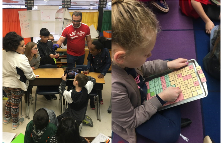
A couple STAR Grants in action: Science Lab experiments(left) and Foundations(right) a phonetic reading supplemental program. (Pictures from 2019)

In the fall of 2019, the Abilene Education Foundation awarded 106 grants totaling $75,750 to 122 different