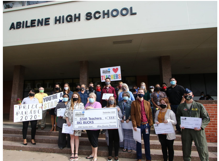
Picture is from fall 2020 Prize Parade