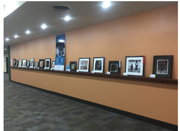
Exhibit displayed at One AISD Center.