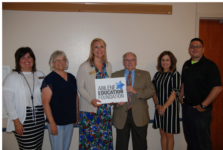
AEF Board members awarding GIFT grants in 2019.

You’ve aced the interview and landed your first job as a teacher. Now it’s time to set up your first classroom. Teachers spend an average of $479 per year of their own money in support of their students, according to a study by the National Center of Education Statistics 1 . If you’re setting up a classroom for the very first time, the need is often greater. A rug for kids to sit on, organizers to shuttle work to and from school for grading, decorations that make the space feel like a classroom. It starts to add up. Worst of all, you’ve been hired but your first paycheck isn’t coming for another month!